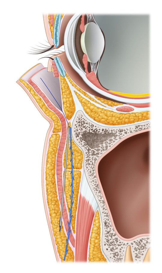
Fig. 2 Schematic illustration of thread insertion. The cannula starts subperiosteal level from arcus marginalis at the entry point and advances into a more superficial direction, passing the deep fat pad and SMAS layer

Each patient underwent preoperative and postoperative photography. Surgical outcome was assessed using the Modified Fitzpatrick wrinkle scale (MFWS), Allergan®