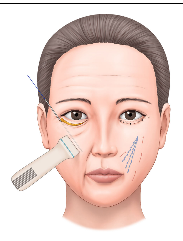
Fig. 3 The thread-containing cannula is inserted after passing through the arcus marginalis. The insertion direction is guided towards the superficial layer, traversing the deep fat pad and superficial muscular aponeurotic system (SMAS) layer, and finally stopping superficially under the dermis, medially to the nasolabial fold, while utilizing portable handheld ultrasonography for guidance